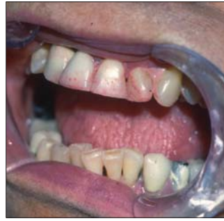
Figure 2. The lips, tongue and all mucosal surfaces are dry in this patient with Sjögren's syndrome. Note also the erosion and the presence of epithelial debris on the teeth, a sign of diminished salivary secretions.

On examination, the patient with xerostomia due to reduced salivary gland function usually has obvious signs of mucosal dryness. 1 The lips may be cracked, peeling and atrophic; the buccal mucosa pale and corrugated in appearance; and the tongue smooth and reddened with loss of papillation (Figure 1). The oral mucosa may appear reddened, thinner and more fragile. There is often a marked increase in erosion and dental caries, particularly at the gingival margin, and even cusp tip involvement. The decay may be rapid and progressive even in the presence of excellent oral hygiene (Figure 2). One should consider whether the caries' history and current condition are consistent with the patient's oral hygiene. Candidiasis, most frequently of the erythematous form, is frequent and may contribute to mucosal sensitivity. The salivary glands should be examined for enlargement, changes in texture, and pain and also to determine if saliva can be expressed from the main excretory ducts. The saliva should be clear, watery and copious. A cloudy exudate may be a sign of bacterial infection, although some patients with very low salivary output will have opaque secretions that are sterile.